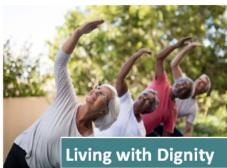
Living with Dignity